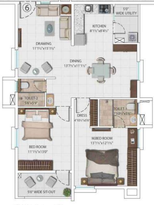
1275 sft E. F