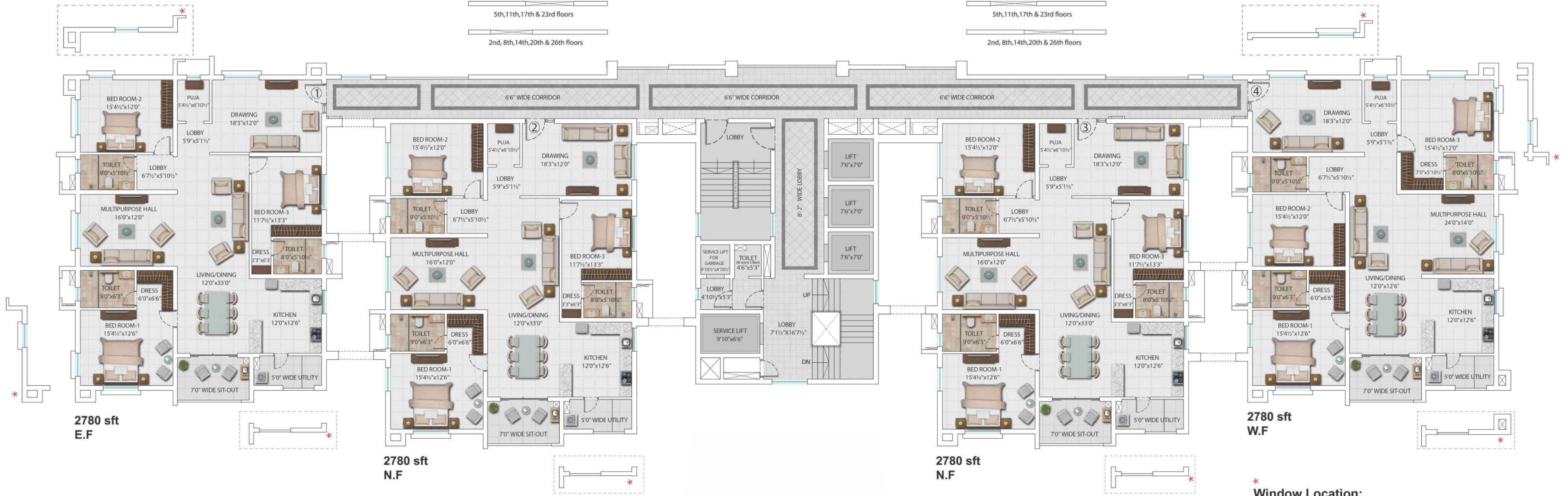
2780 sft E.F

5th, 11th, 17th & 23rd floors 2nd, 8th, 14th, 20th & 26th floors