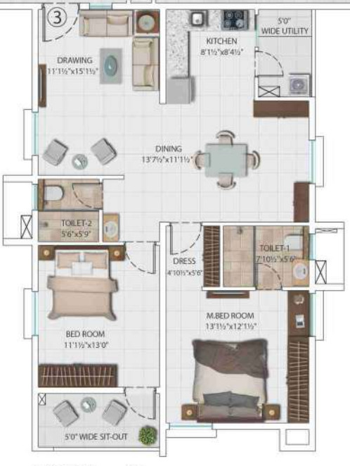
1275 sft E. F