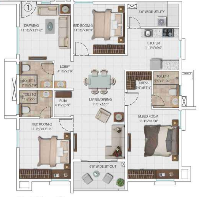
1740 sft E. F

* Window Location: 4th, 5th, 6th, 7th, 12th, 13th, 14th, 15th, 20th, 21st, 22nd & 23rd Floors