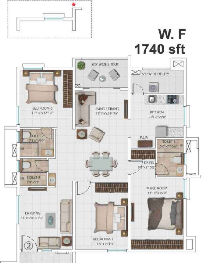
W. F 1740 sft