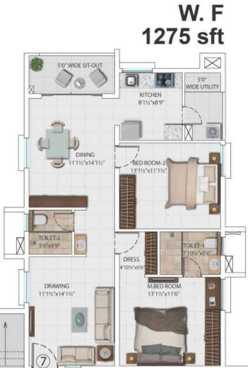
W. F 1275 sft