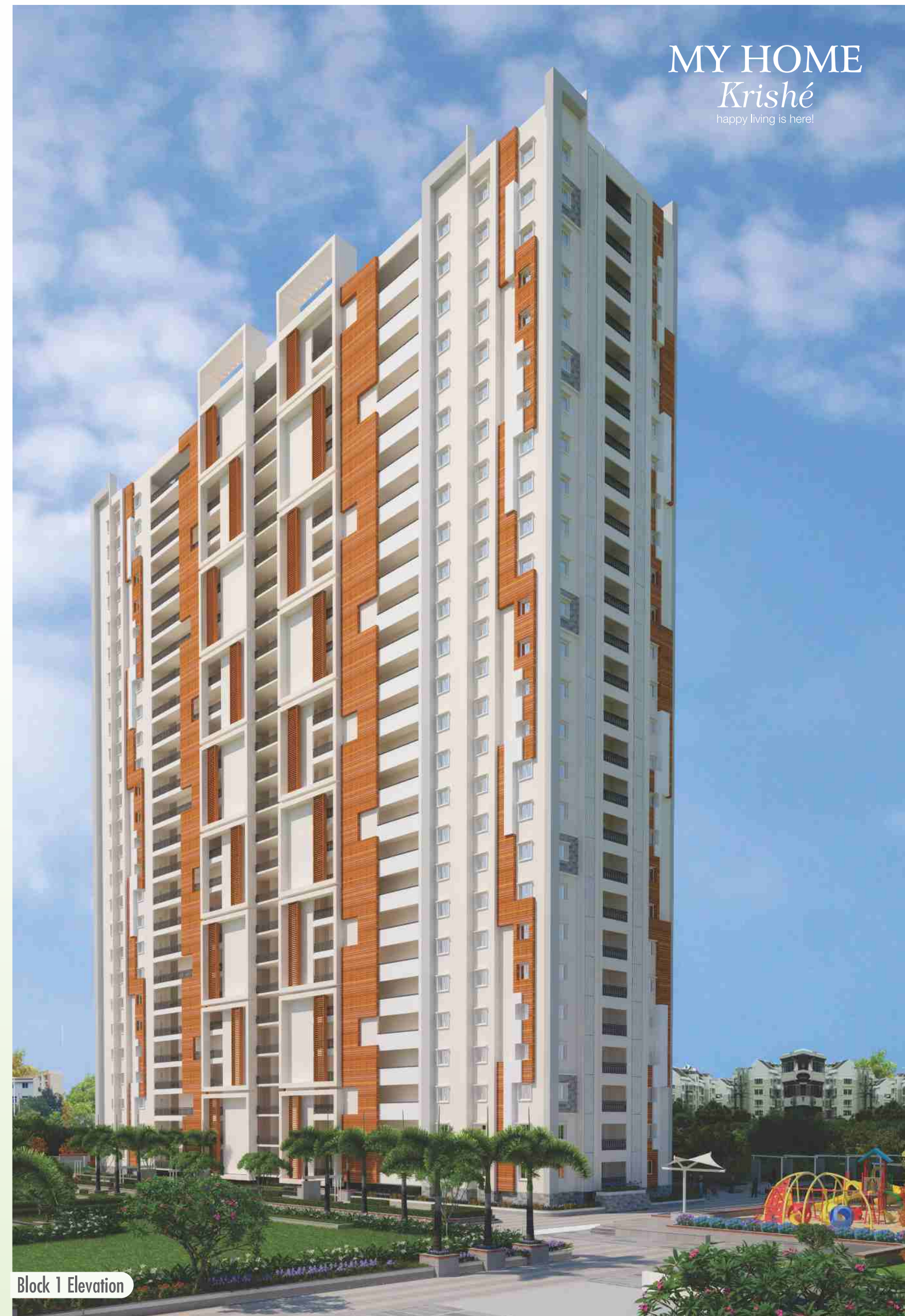
Block 1 Elevation