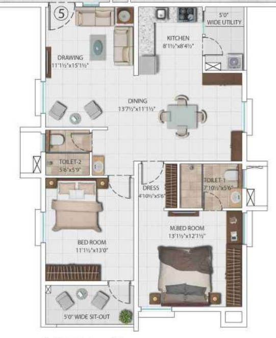
1275 sft E. F