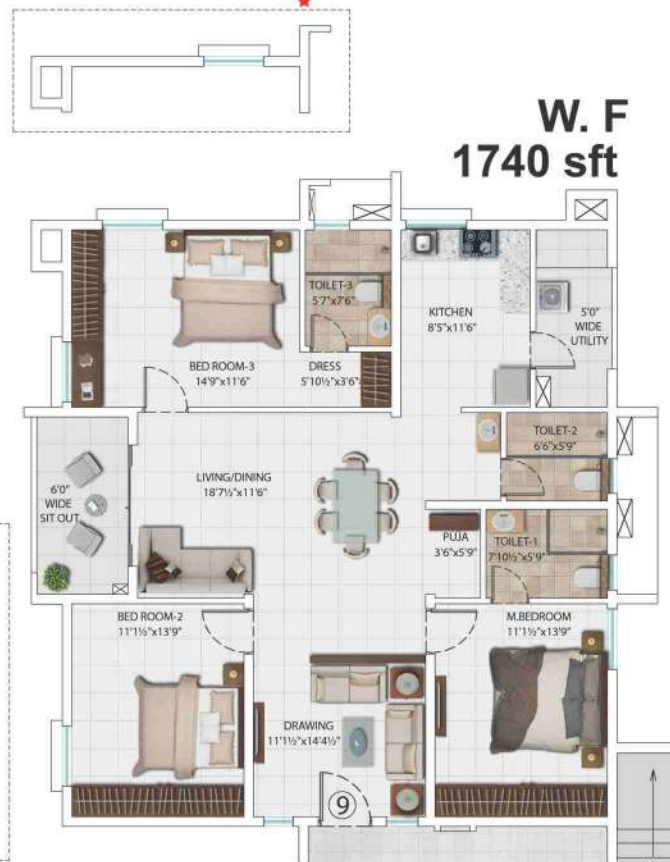
W. F 1740 sft