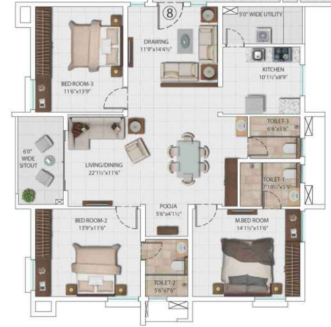
1740 sft E. F