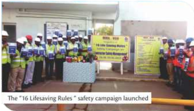
The "16 Lifesaving Rules " safety campaign launched