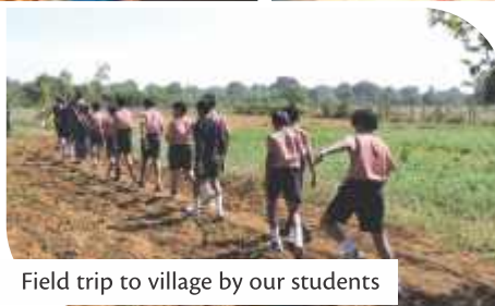
Field trip to village by our students