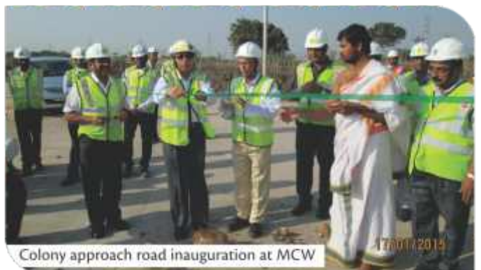
Colony approach road inauguration at MCW