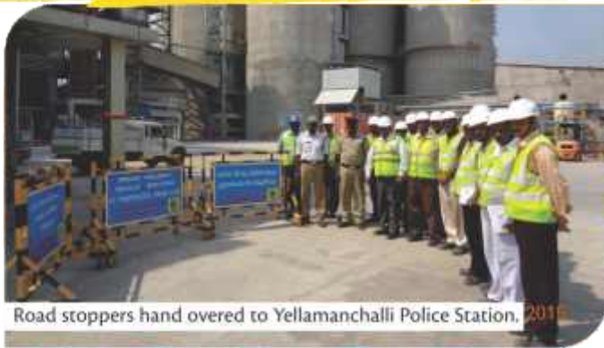
Road stoppers hand overed to Yellamanchalli Police Station, 2015