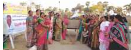
Swachh Bharath Programme at VGU