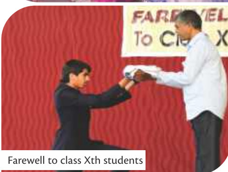
Farewell to class Xth students