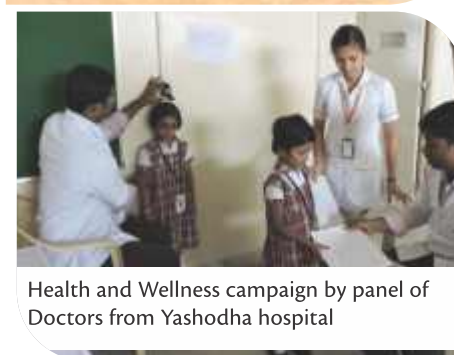
Health and Wellness campaign by panel of Doctors from Yashodha hospital