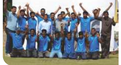
Bramhostavalu at MCW