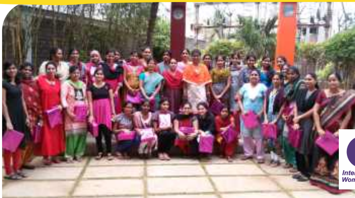
International Women's day Celebration at My Home Constructions