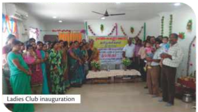
Ladies Club inauguration