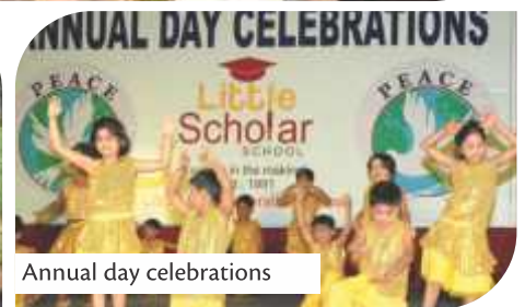
Annual day celebrations