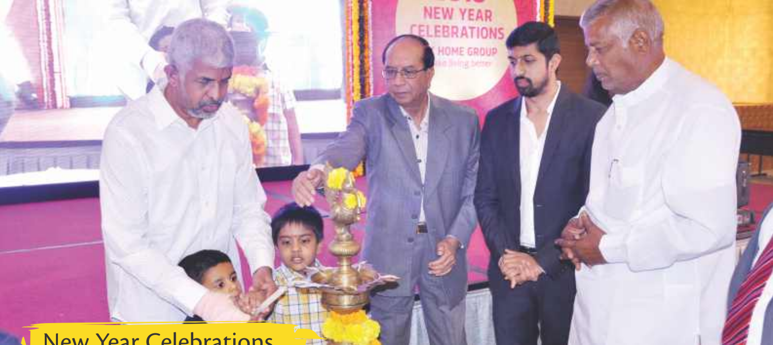
New Year Celebrations