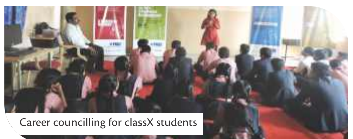
Career counselling for classX students