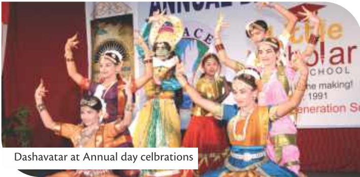
Dashavatar at Annual day celbrations

These activities will provide them a platform to explore their innate talent and contribute in increasing their self-esteem. Little scholar school is always a step ahead in maintaining balance between study life and extracurricular activities, there by moulding a child as skilled individual.