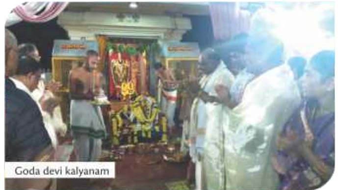
Goda devi kalyanam