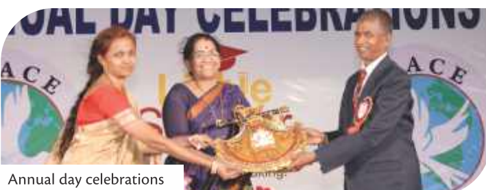
Annual day celebrations