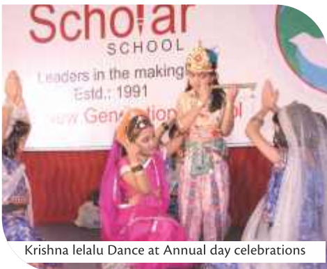
Krishna lelatu Dance at Annual day celebrations