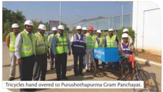
Tricycles hand overed to Purushothapurma Gram Panchayat.