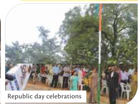
Republic day celebrations