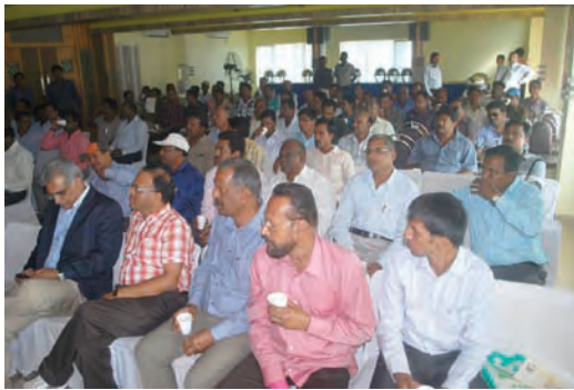
Maha Shakti Dealers' meet and the launch of Maha Supremo on 24th Nov 2011 at Jeypore and 25th Nov 2011 at Berhampur, Odisha.