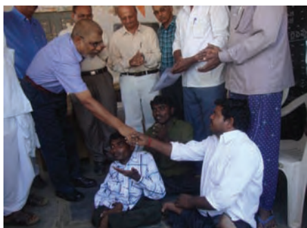
Under Corporate Social Responsibility, MHIL (MCW) donated "TVS tri-cycle" for physically challenged persons of chouta-palli village on 22.09.2011 at Gram-panchayat office, Choutappally.